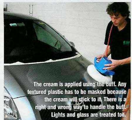
The cream is applied using the buff. Any textured plastic has to be masked because the cream will stick to it. There is a right and wrong way to handle the buff. Lights and glass are treated too.