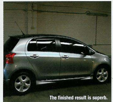
The finished result is superb.