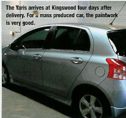
The Yaris arrives at Kingswood four days after delivery. For a mass produced car, the paintwork is very good.