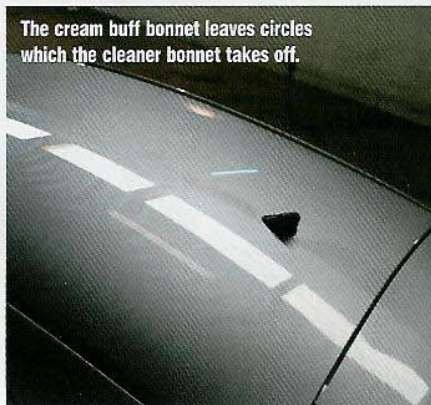
The cream buff bonnet leaves circles which the cleaner bonnet takes off.