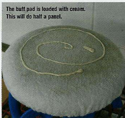
The buff pad is loaded with cream. This will do half a panel.