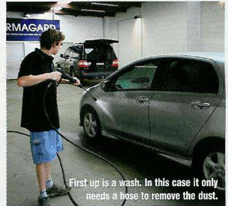
First up is a wash. In this case it only needs a hose to remove the dust.